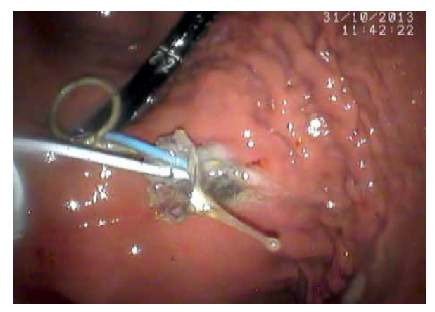
Figure 1. Transgastric endoscopic drainage/ debridement. The transmural self-expandable metallic stent (SEMS), stent 'double pigtail' 7 Fr and nasal drain 7 Fr, inserted through the stoma into the area of pancreatic necrosis. Difficult approach to fistula in the long scope position