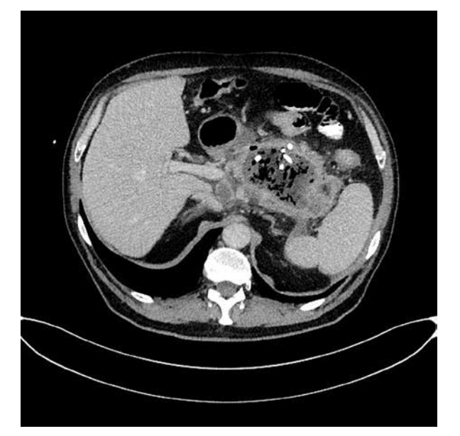
Figure 3. The patient with walled-off pancreatic necrosis visible in contrast-enhanced computed tomography (CECT) during endoscopic transmural drainage/debridement (8<sup>th</sup> day of drainage)

theless, we still hold the view that in some patients